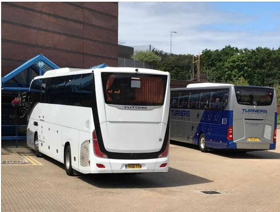
The white coach is a 2020 Chinese Yutong model ZK6129HQ coach, operated by Corbel Coaches from London. The coach runs in a white unmarked livery as apart from private hire the coach sometimes operates services for Flixbus, mentioned later. Yutong are gaining some market share in the UK due not only to the cost of the vehicles and their development of a competitive electric single decker vehicle. https://www.route-one.net/news/yutong-e-bus-best-in-class-after-millbrook-results-says-dealer/