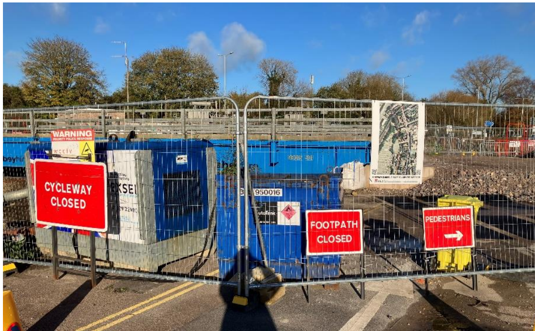
Groundworks at the Mill Stream Coach Park. Cycleway and Footpath closed with closed road bridge over river Avon in the background.

Public Toilets are available just by the parking area but payment of a 50p charge is required to access them. The toilets are the only facilities available and also the coach stop is not provided with any shelter. Thus, the small section of the roof over the toilets building that covers a portion of the pavement by the coach stop is the only element providing some sort of shelter from the elements.