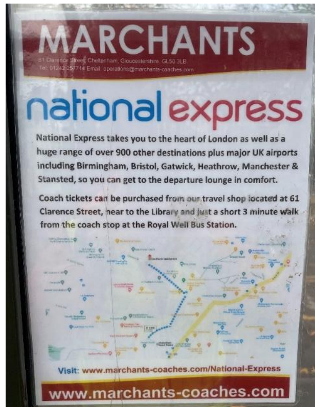
Cheltenham Royal Well Coach Station - The only National Express sign present on site.