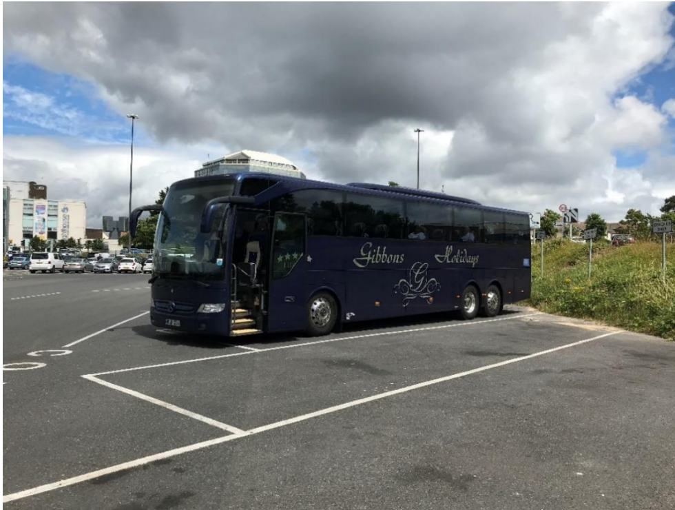
A Mercedes Tourismo 49 seater six wheeler luxury coach operated by Gibbons Holidays of Cardiff seen parked in Poole Coach Park. Again this coach is in use for tourism purposes with the driver away from the Welsh home operating centre for several days.