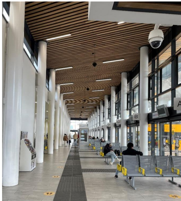
Gloucester Transport Hub - Inside View

Beside the information provided by the digital boards, there is also an information and ticket office run by Stagecoach West. However, the office does not sell National Express tickets. Passengers who want to purchase a ticket for one of the coach services need to scan a QR code from a sign displayed just by the ticket office directing to the website where tickets can be purchased. This appears to be the norm for National Express as most locations surveyed as part of the site visits series featured this sign and no ticket office or machine were present. Only major hubs such as the Bristol Bus and Coach Station and Bournemouth Coach Station also have the machines and office.