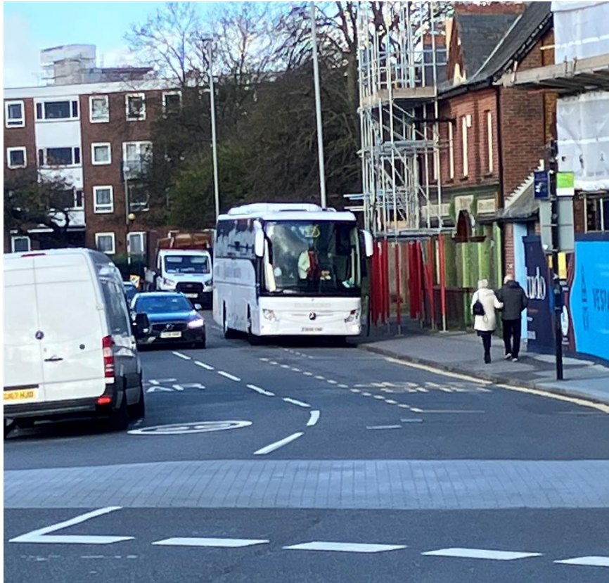
Old Orchard Drop Off - A coach parked in the drop-off bay and a car overtaking it while invading the opposite lane