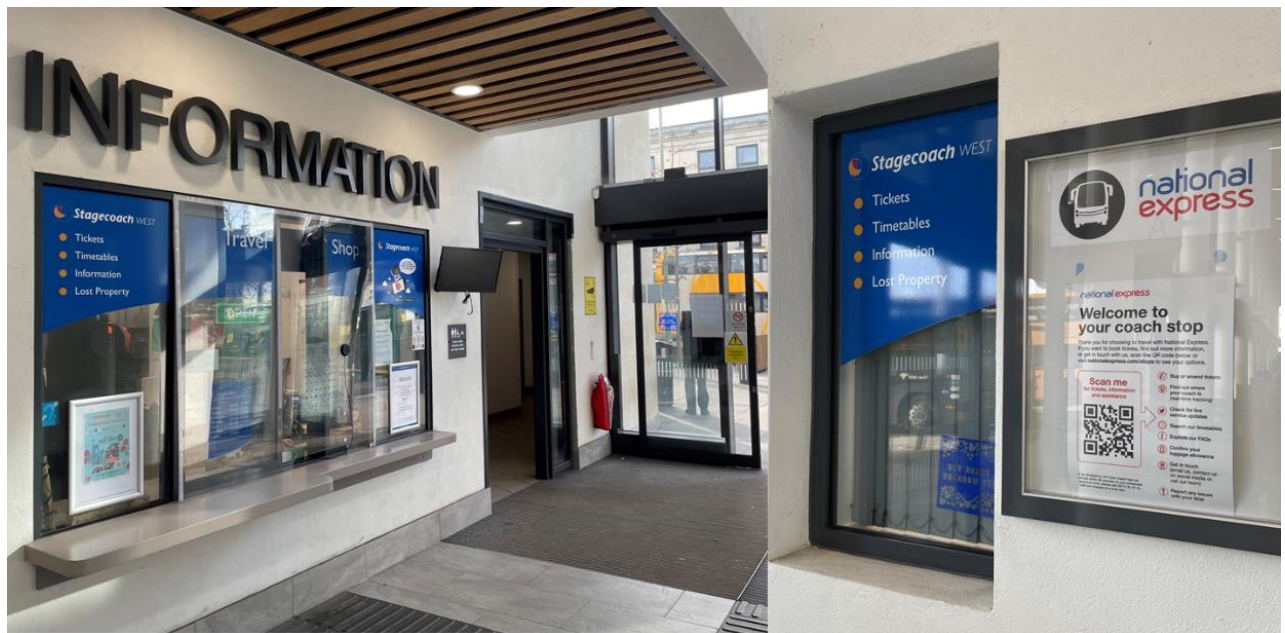
Information & ticket Office and National Express sign with QR code directing to website

The only element of this modern bus station that could generate complaints from the public is that toilets are available but for a small fee of 20p to be paid by card on the cubicle's door. The toilet rooms have cubicles for females, males one unisex cubicle and one accessible toilet which is free and at the time of visit the door was open so anyone could use it avoiding the 20p fee. A baby change/family room is also available for 20p.