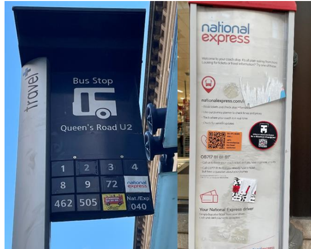
University of Bristol Coach Stop - Signs