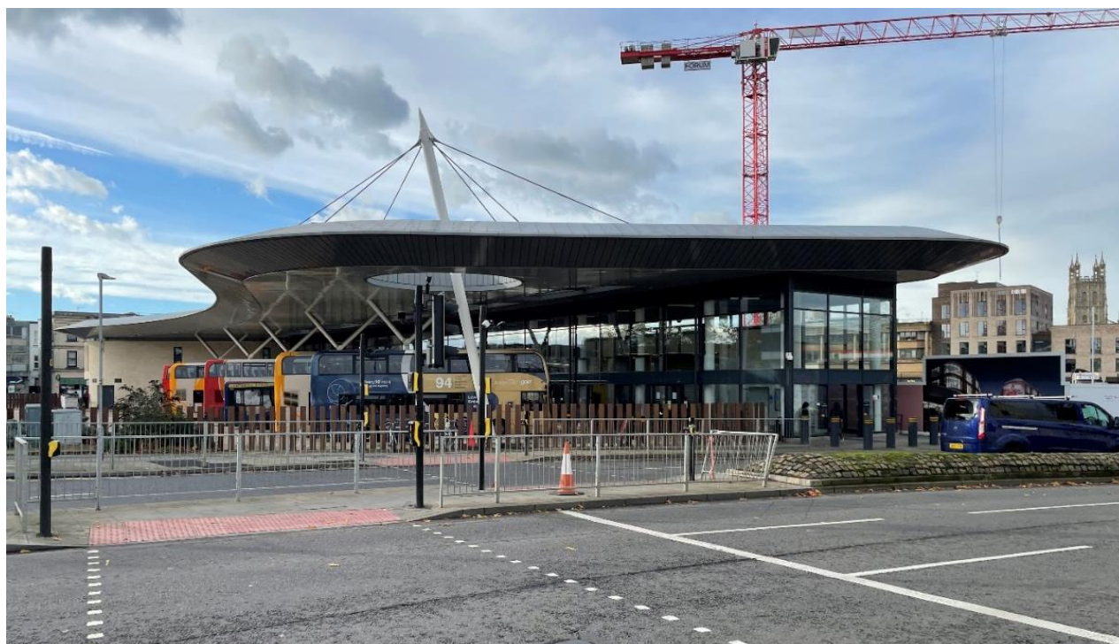
Gloucester Transport Hub - Outside view while approaching from the station

Gloucester Transport Hub is the most recently constructed facility among those surveyed as it was opened to the public in October 2018. The image above is of the outside of the station.