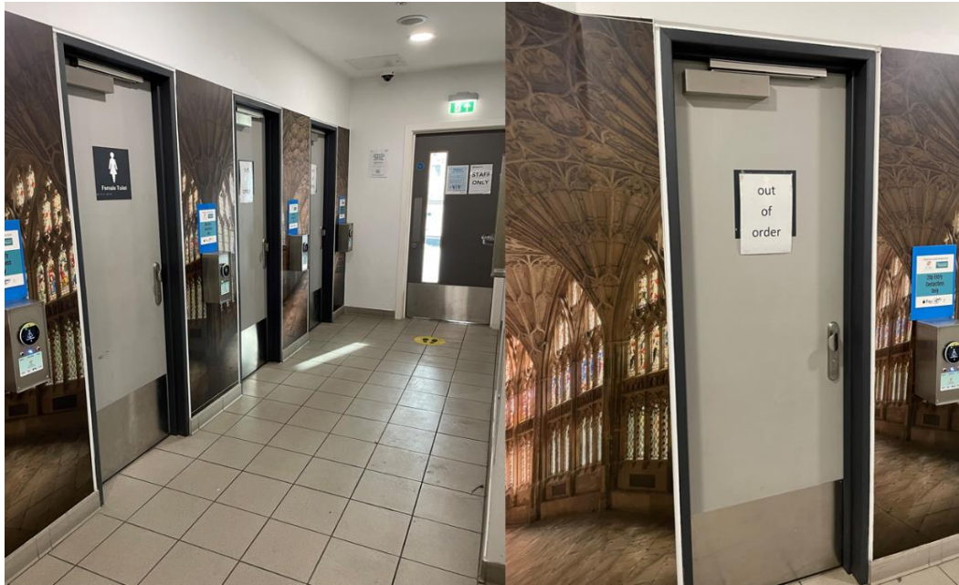
Gloucester Transport Hub - Toilets and Out of Order sign