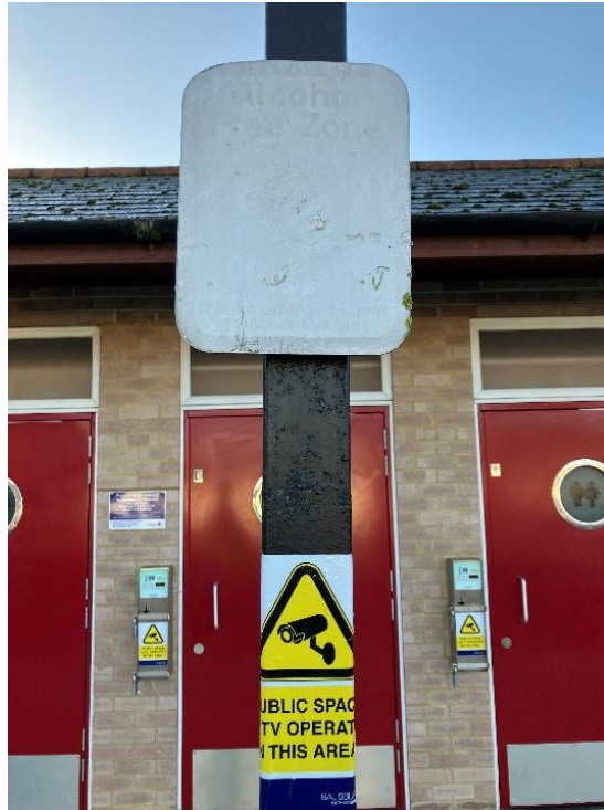
Mill Stream Coach Stop, signs by the stop bay