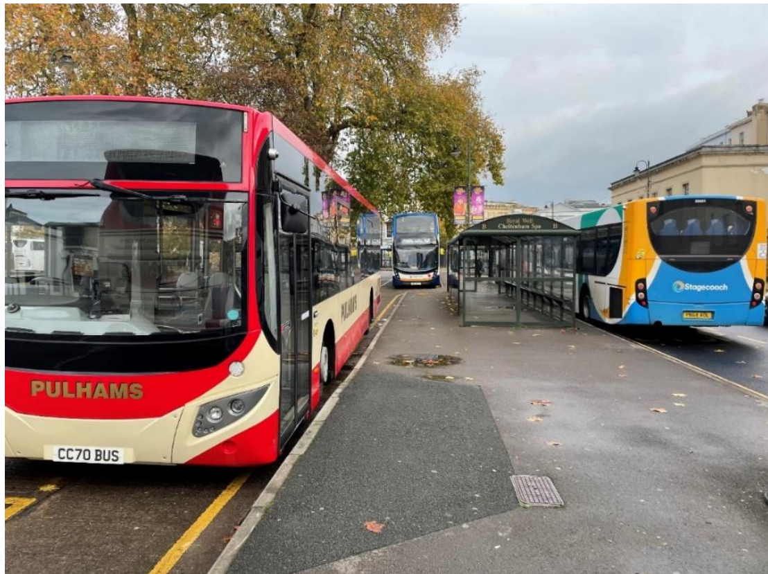
Royal Well Coach Station - Pedestrian island with stops on both sides