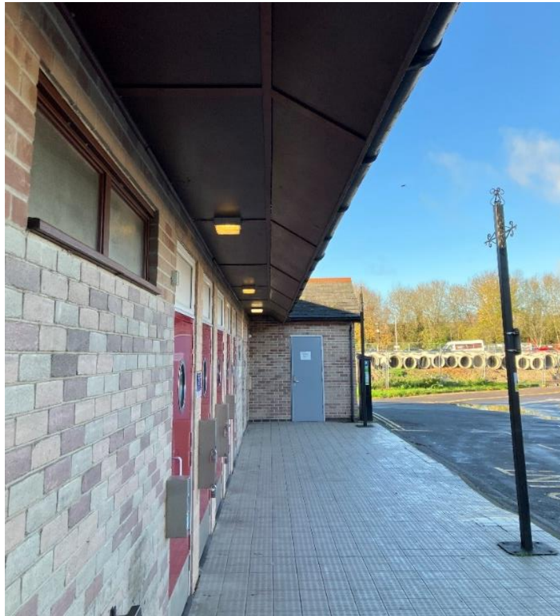
Mill Stream Coach Stop - On the left the toilets, on the right the coach stop used by scheduled services

A major issue of this site is the lack of information provision and wayfinding. In fact, there is no way to tell that National Express services stop there and if it was not for the instructions provided online by the operator, it would have been impossible to identify this stop's location. By the stop's bay, there is a pole with no timetable, nor National Express logo in it. The only signs on the pole are one about the presence of CCTV cameras and the second indicating that it is an 'Alcohol Free Zone'. Also, the route that passengers should follow to reach the coach stop or the parking bays is unsigned and hard to discern. The information panels for the nearby groundworks mention a separate project to improve the coach park which will lead to a makeover of the surfaces and to the installation of improved information and wayfinding signs for coach passengers.