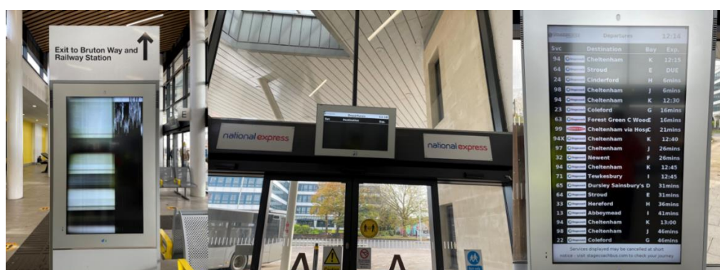
Gloucester Transport Hub - Digital Boards

Given its recent construction, the station appears to adhere to current regulations in terms of accessibility. Indications of this are the absence of steps across the station and the extensive use of tactile pavement which lead to every bay as well as to the ticket office and includes several technological features such as live departure boards at every bay and information totems, although not all the technological elements were working properly at the time of visit.