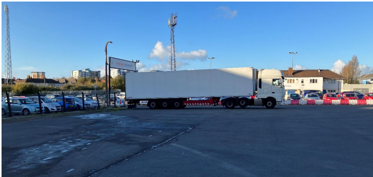
Poole Stadium Lorry and Coach Park

The Poole Stadium Lorry and Coach Park is a very basic parking area found near the Poole Stadium Speedway. It offers bays for long-stays up to 24 hours for coaches and lorries. At the time of visit the site was very quiet and only a couple of lorries were parked there. That is because it was not an event day at the Poole Stadium and it was also during the low-season for tourism. The site has no actual facilities for passengers or for drivers. The location is not very central but well connected to the rest of the town, quite close to the station and relatively easy to reach for coaches that drop passengers in the town centre or closer to the waterfront. During the off-peak tourism season, given the low demand for coach bays, it is likely that coach drivers prefer to park at the Seldown Coach Park which is closer to the centre. However, already on a weekday in November that site was nearly at capacity so the Stadium Coach Park is useful to provide additional capacity during the summer months.