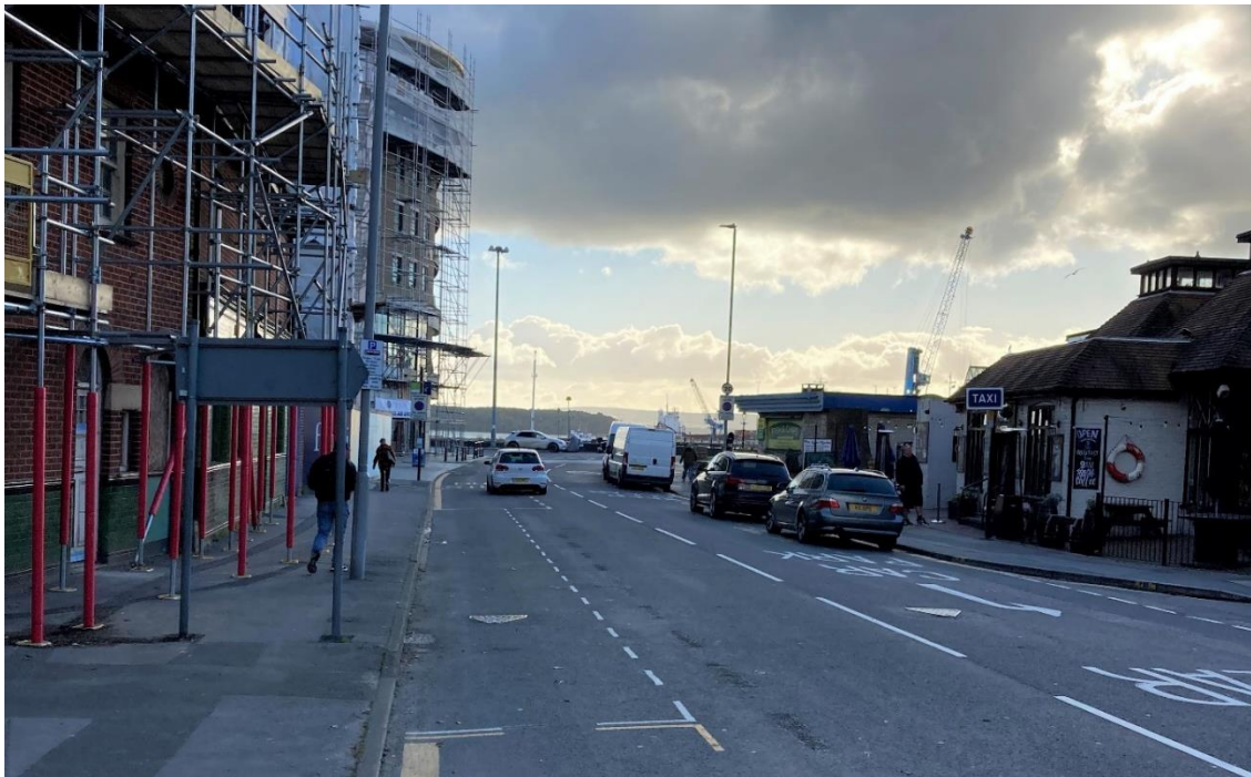
Orchard Road Drop Off Coach Bay, Poole

This is a very basic drop-off bay near the promenade in Poole with no dedicated infrastructure. The site is not very well signed but the bay is clearly marked on the road although it misses the surface lettering that can make it easier for road users to understand what type of vehicle should stop there. In addition, the coach bay is along the kerb at a point where there is no additional road space, meaning that when the bay is occupied, the space for vehicles on the road reduces significantly. As can be seen in the following image, there are often parked vehicles on the other side of the road, meaning that when a coach is stationary in the dedicated bay the road becomes very narrow with the associated hazards induced. In fact, the coach bay is not wide enough for a coach which take more space than expected causing cars to overtake the parked coach in an unsafe way, with invasion of the opposite lane. This situation that can get even worse if at the same time a local bus gets at the nearby bus stop, in this case there is no physical space for two vehicles going in opposite directions.